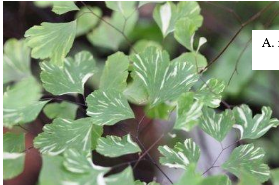
A. raddianum 'Variegatum'