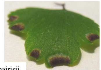
A. x mairisii